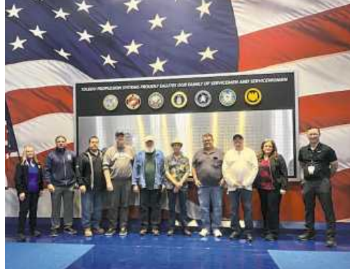
Retirements - April 2025