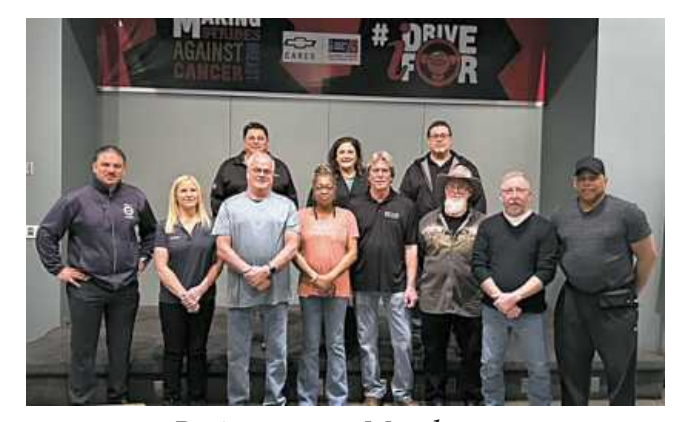
Retirements - March 2025