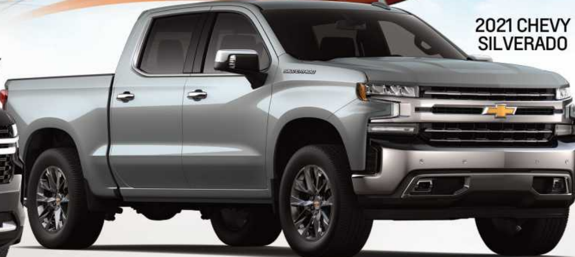
2021 CHEVY SILVERADO