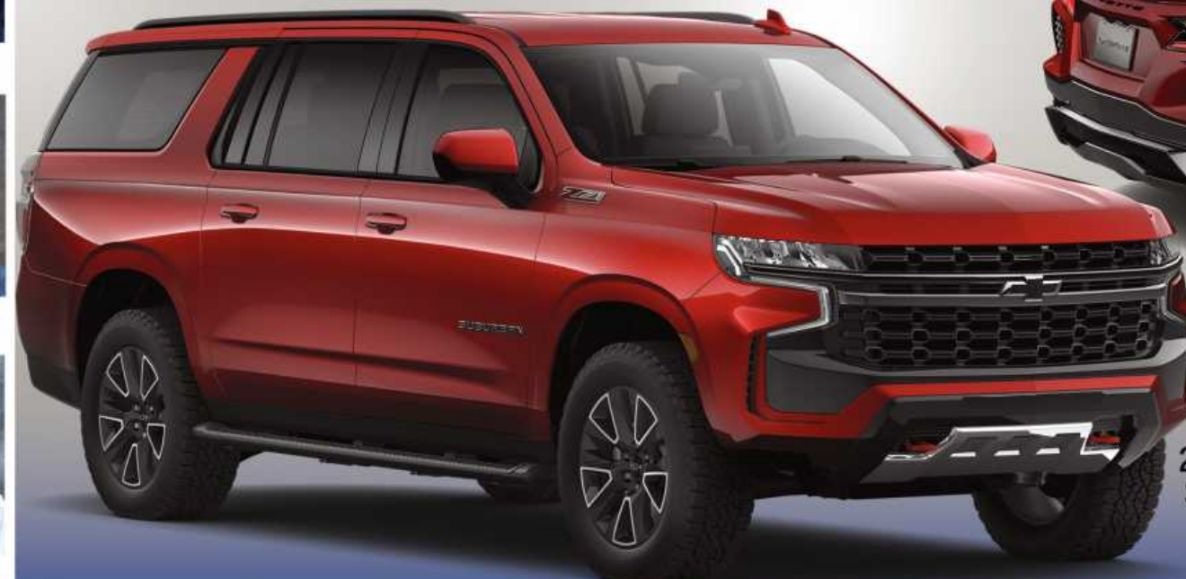
2021 CHEVY SUBURBAN