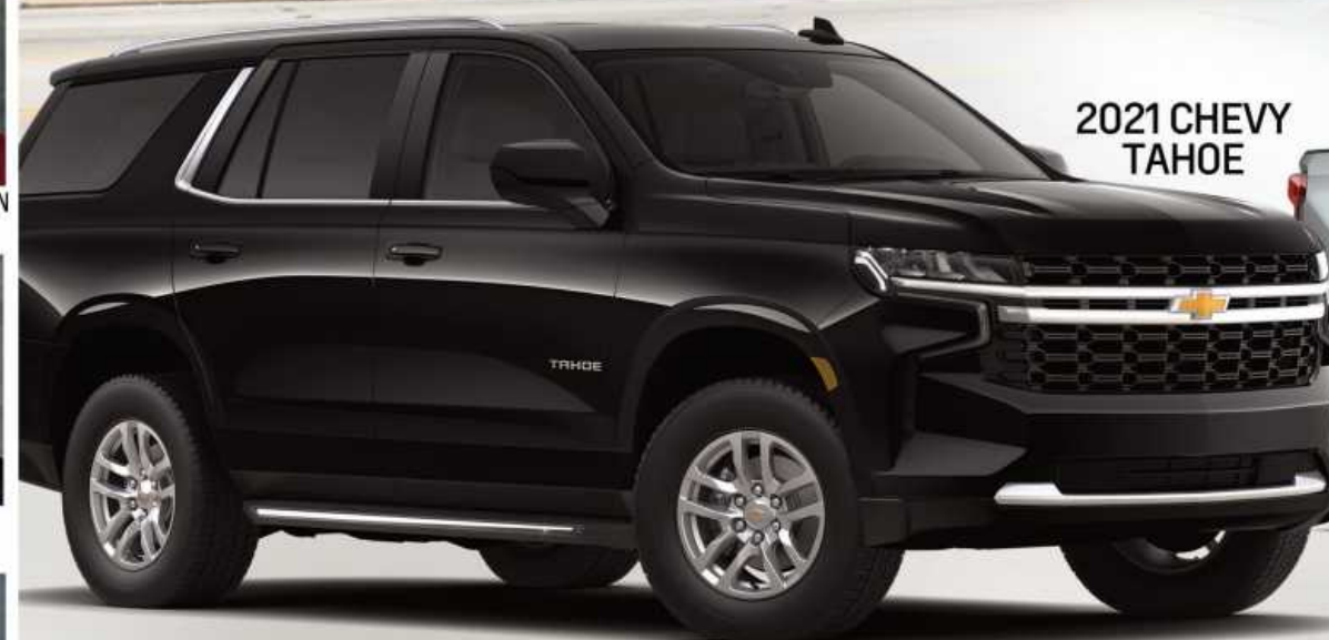
2021 CHEVY TAHOE