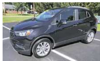
2019 BUICK ENCORE PREFERRED SPORT UTILITY