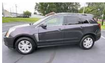
2015 CADILLAC SRX LUXURY SPORT UTILITY