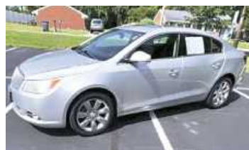
2011 BUICK LACROSSE SEDAN