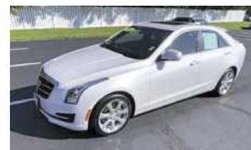
2016 CADILLAC ATS LUXURY SEDAN