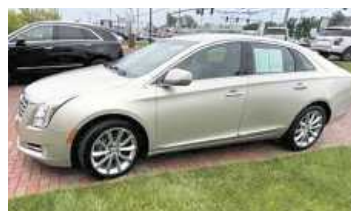
2013 CADILLAC XTS LUXURY SEDAN