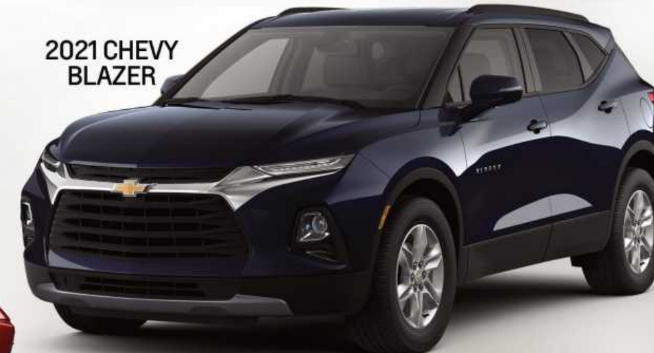
2021 CHEVY BLAZER