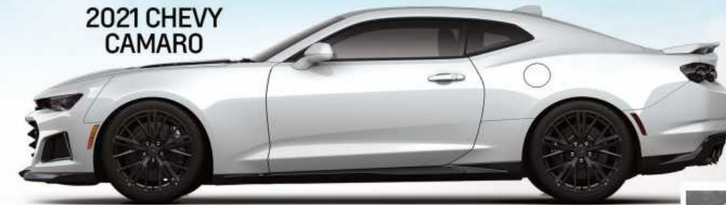
2021 CHEVY CAMARO