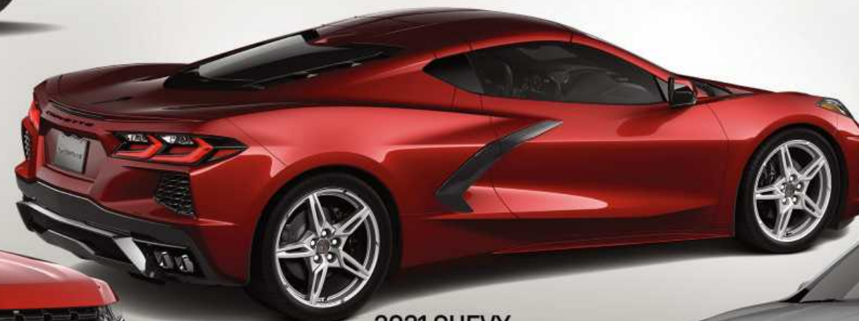
2021 CHEVY CORVETTE