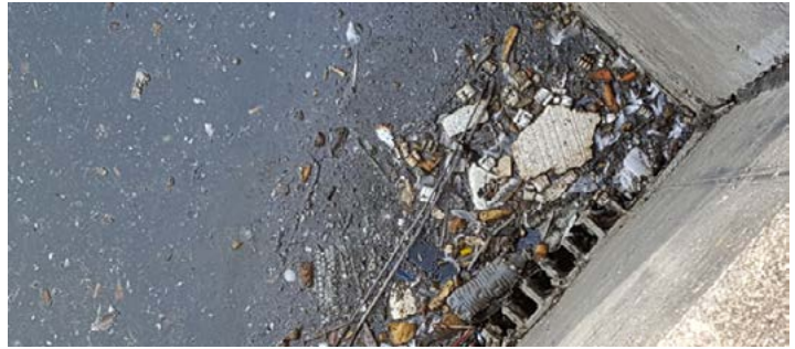
Clogged storm drain.

WHEN: Wednesday, August 29 CLASS TIMES: 2pm, 3pm and 4pm WHERE: Education and Training.