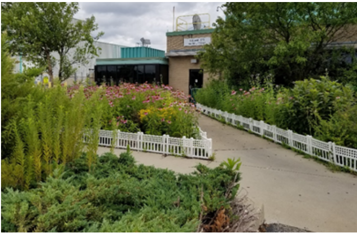
East Gate pollinator garden