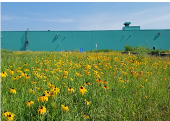
Wildflower prairie South of RWD Assembly