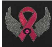
Women's V-neck (S-2XL) *not actual image