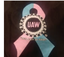
Men's Crew neck w/ pocket (S-4XL)

Please contact Chrissy Horvath in the plant. Thank you for your support!