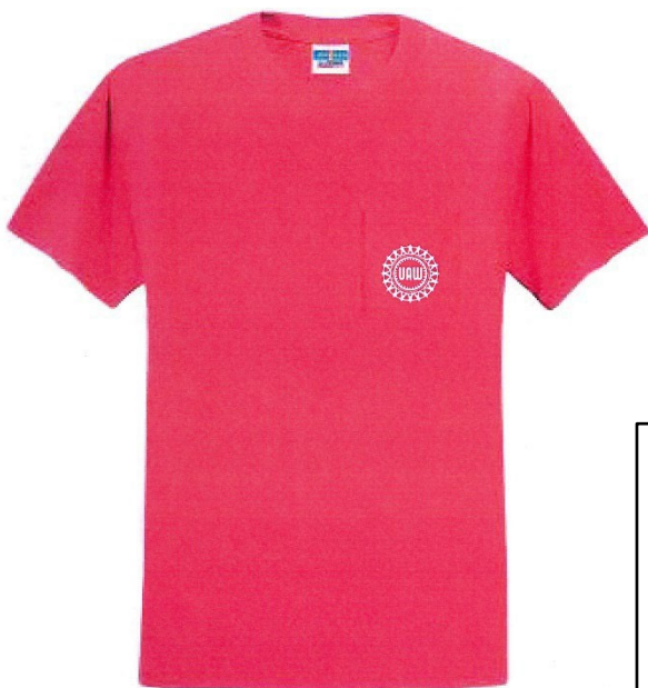
UAW Local 14 Pocket tee

Receipt No. _____ Date Rec'd Shirt _____