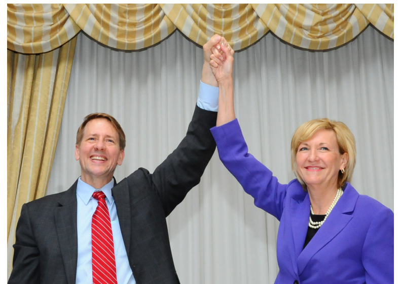
UAW supports Richard Cordray for Ohio Governor and Betty Sutton for Lieutenant Governor.