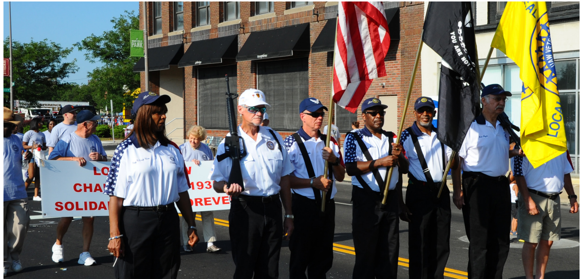
Local 14's veterans committee leads the way for our members during the Labor Day Parade, showing our union spirit as the Nov. 6 election draws near. (See pages 10, 11, and 12 for more parade photos.)