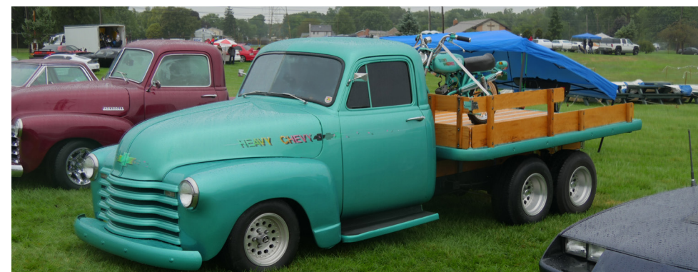
Rain and cold weather failed to dampen the spirit of lots of car owners who came out for the annual Park - N - Shine event. Above are some of old and new vehicles on display.