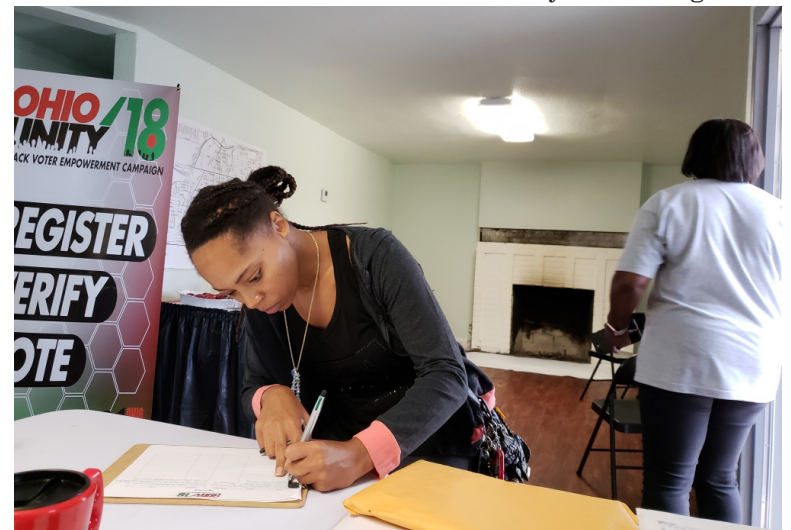
Local 14 women gathered to register voters for the upcoming election on Nov. 6. The message was register, verify, vote in this important election.

Return order form with payment to Local 14 Union Hall OR contact a Union Label Committee member.