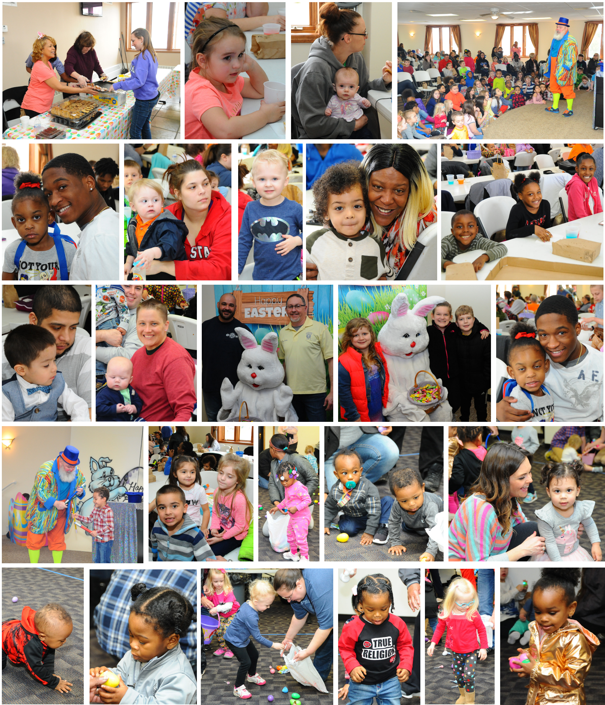
Above are some scenes from this year's Easter Egg Hunt held at Local 14 Hall. It was fun for the whole family.