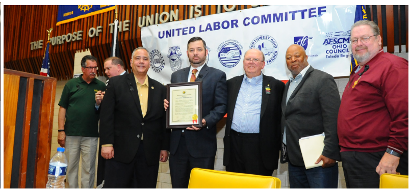
Toledo City Council issues a proclamation.